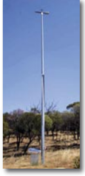
Science and meteorology